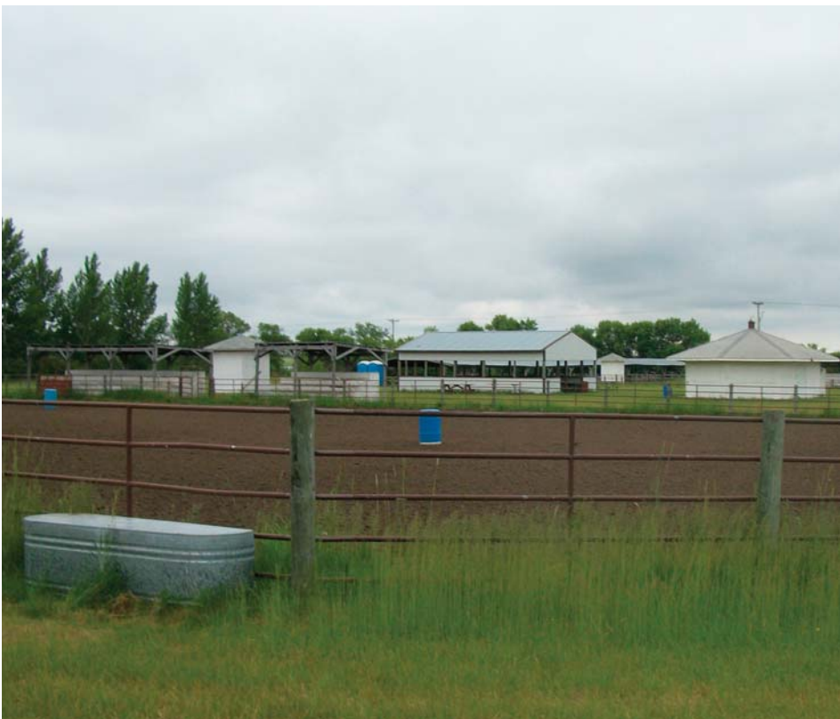
Perdue Ag. Society Rodeo Arena Area to be upgraded