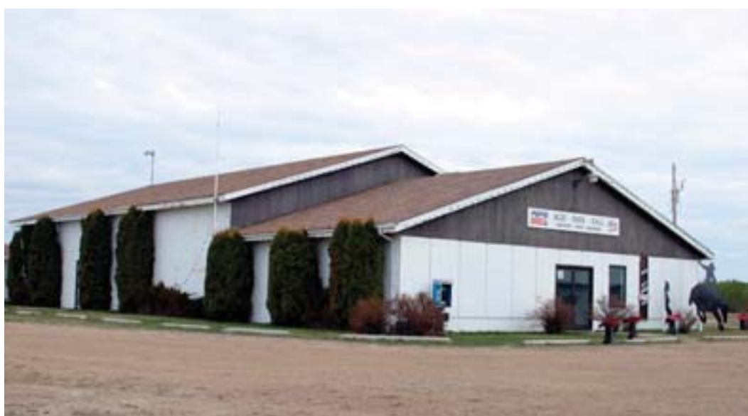
Melville Agri-Park Main Community Hall

The Perdue Agricultural Society was looking for assistance to expand and upgrade the rodeo arena. The Community Vitality Fund approved a total of $10,000 which will be used