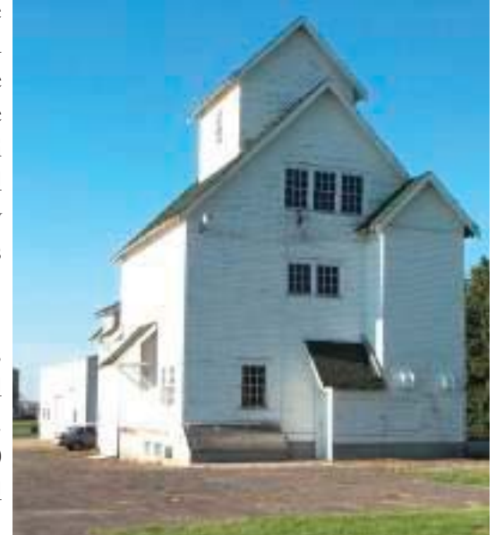
Swift Current Exhibition - Doc's Town

Association received approval for $26,000 to do upgrades to the Agri-Park main community hall. The upgrades will make the hall a much better facility for the many community and youth groups that make use of it on a year-round basis.