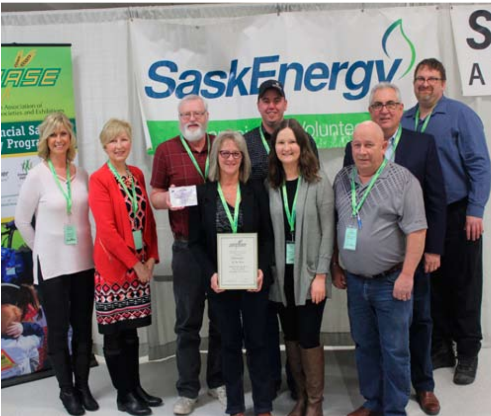
Members of the Swift Current Ag & Ex accept the SAASE/SaskEnergy Achievement of the Year Award