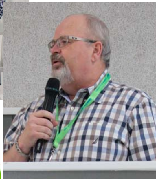
Prince Albert Mayor - Greg Dionne brings greetings from the City of Prince Albert