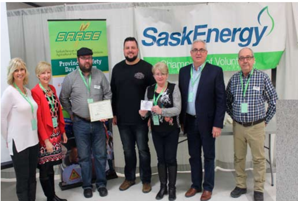
Members of the Prince Albert Exhibition accepts the 135 Year Anniversary Award

Congratulations to all of our winners and thanks to those Agricultural Societies that submitted nominations. SAASE would like to thank SaskEnergy for their continued involvement with the Volunteer Champion Award Program and helping us to recognize the hard working volunteers that make our communities the great places that they are to live.