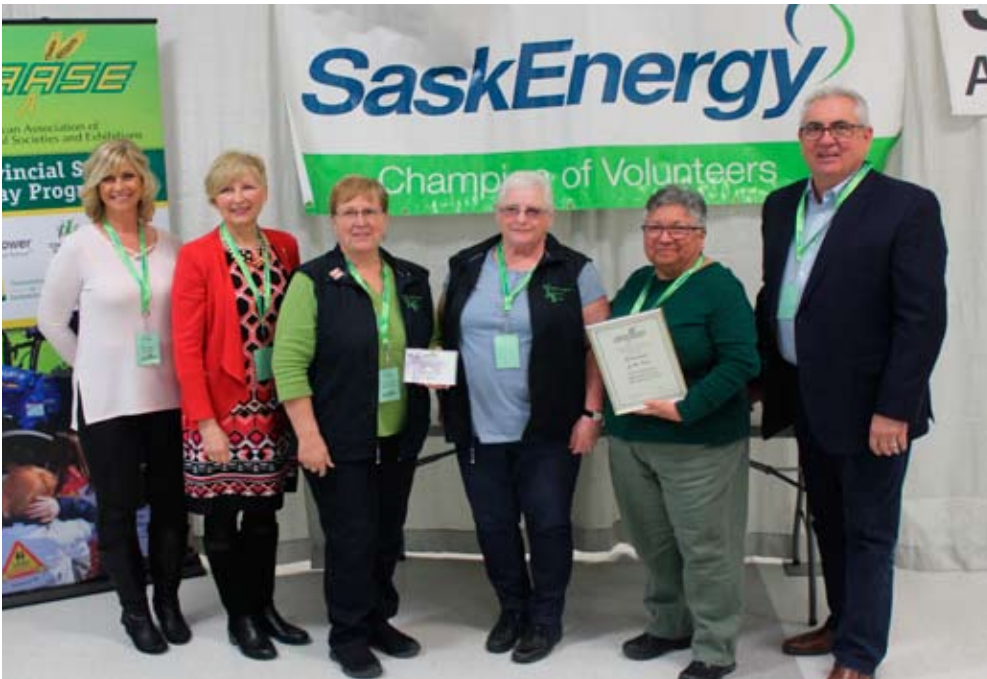
Members of the Vanscoy Ag Society accept the SAASE/SaskEnergy Achievement of the Year Award