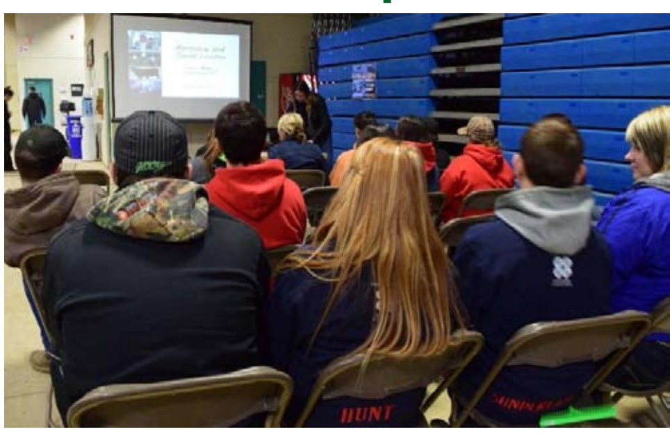
Senior members participate in "Speak up for Beef" station

The focus of this year's event was individual and team judging. Industry experts instructed participants in three divisions – Junior, Intermediate and Senior, on how to properly assess a beef animal. The ability to evaluate animals for conformation and soundness as well as breed traits are important skills as these young people will someday be establishing herds of their own. Given the changes