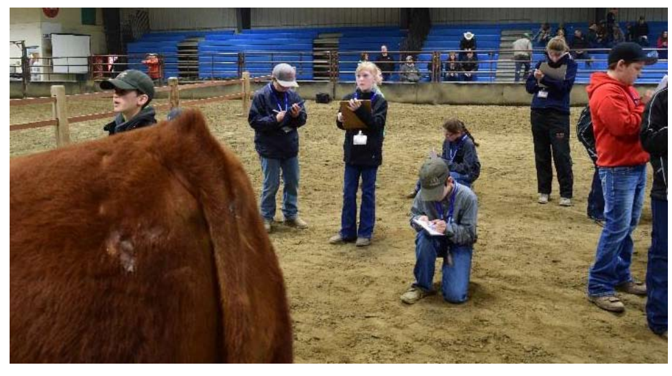
Junior members prepare judging cards.

On day 2 participants had the opportunity to participate in show ring competitions including Market Steer, Heifer and Showmanship classes.