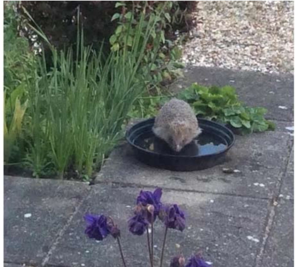
Title: Hedge Hog - Now an Endangered Species - Name: Eve Dunn Town/City: Saxmundham, England