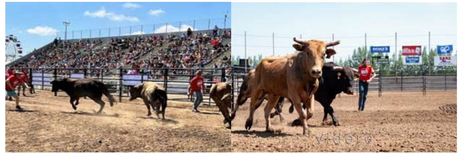
The Lloydminster Agricultural Exhibition Association (LAEA) was looking for a new program/attraction to fill a void at our Lloyd Ex Fair. The event is held during our Lloyd Ex Fair program on Saturday July 16th afternoon.

This event filled a void that was created when we made a significant change in our fair programming, where we added in a 9-day chuckwagon event Chuckwagon racing to the schedule. With the addition of the North American Chuckwagon Championships that saw us get rid of the thrilling (dangerous) events like Monster Trucks and bull riding as the track can't be disturbed to the level that those events would. The new event satisfied the thrill seekers that love to see those events. Being an extreme event, it proved to be a large draw for the urban sector and will bring them to a rural event that will see cowboys, urban thrill seekers and cheering fans come together.