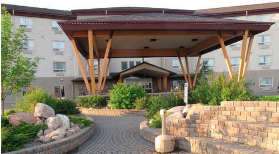
Host Hotel - Gold Eagle Lodge - North Battleford