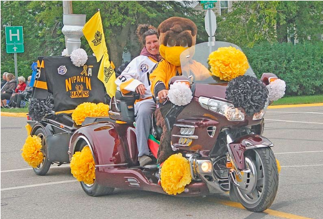
The Nipawin Hawks on their bike-float.

This is the Venture Project Report submitted by the Nipawin Exhibition.