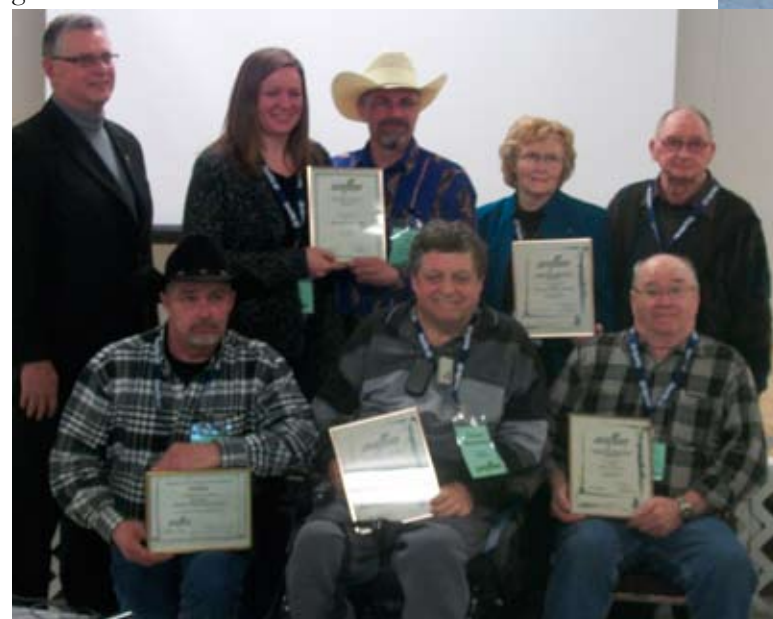
SAASE Award Recipients 2014