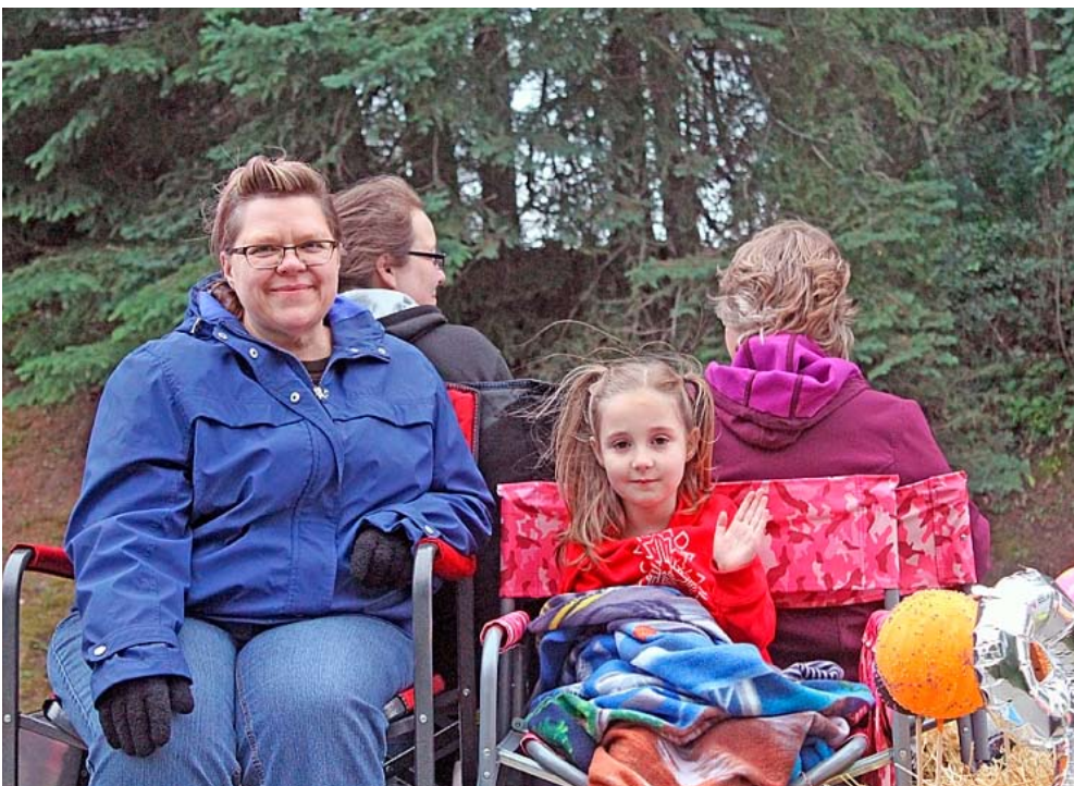
A parade float rider waves to the crowd.

Taking on this event added extra expenses for the Exhibition Association so we are very grateful for the Financial Assistance from the Venture Project Grant from SAASE.