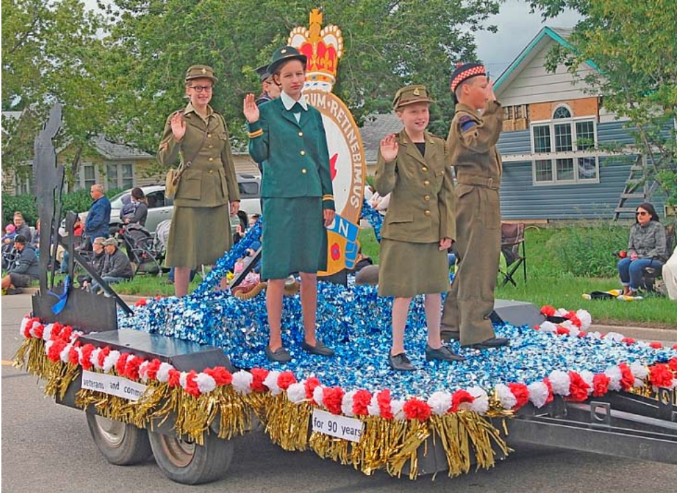
The Nipawin Legion's float in the parade.

best interests of the Local Businesses and therefore would not look after the Parade. They also did not feel that playing a role in the Family Day celebrations was within their mandate.