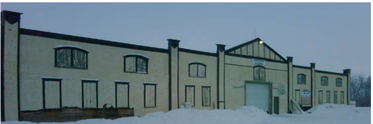
Community Vitality Project at the Yorkton Exhibition

A complete list of grant recipients and more information about the Community Initiatives Fund are available at: www.cifsask.org .