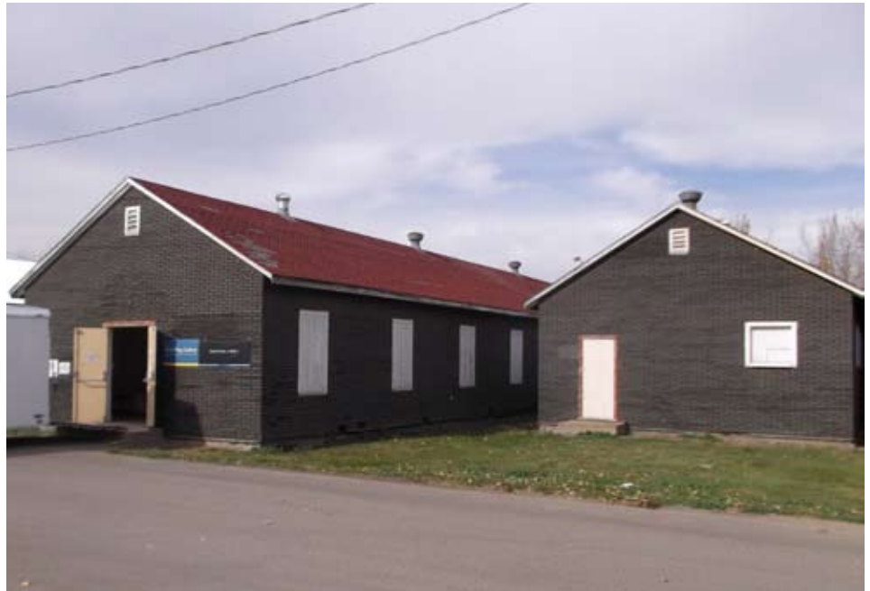
Swift Current Exhibition H Hut Community Vitality Project

Within the press release the Community Initiatives fund also announced that they will be extending the Community Vitality Program an additional year - through 2013. This is great news for all communities in Saskatchewan. The deadlines for next year are April 1 and October 1. If you are looking at any kind of small capital project on your