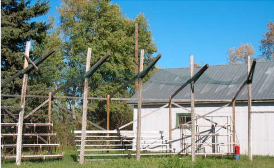
Community Vitality Project at the Connaught Agricultural Society

Program grants totaling $1,592,017 support the health and well being of Saskatchewan's vulnerable children, youth and families. Grants through its Community Vitality Program total $1,654,978 for 131 small capital projects and celebrations of community pride and diversity. One grant through each of the Physical Activity Grant Program and the Problem Gambling Prevention Program total $57,685. An additional Youth Leadership grant adds $25,000 more to CIF's overall contribution to Saskatchewan residents' quality of life. There are two CIF grant application deadlines each