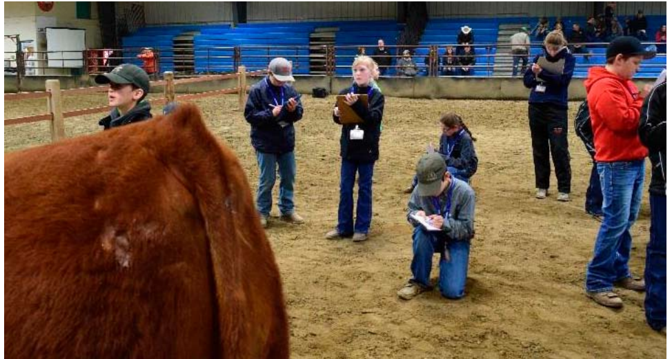
Junior members prepare judging cards.

On day 2 participants had the opportunity to participate in show ring competitions including Market Steer, Heifer and Showmanship classes.