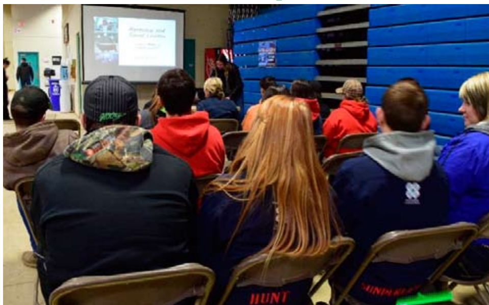
Senior members participate in “Speak up for Beef” station

The focus of this year's event was individual and team judging. Industry experts instructed participants in three divisions – Junior, Intermediate and Senior, on how to properly assess a beef animal. The ability to evaluate animals for conformation and soundness as well as breed traits are important skills as these young people will someday be establishing herds of their own. Given the changes in the