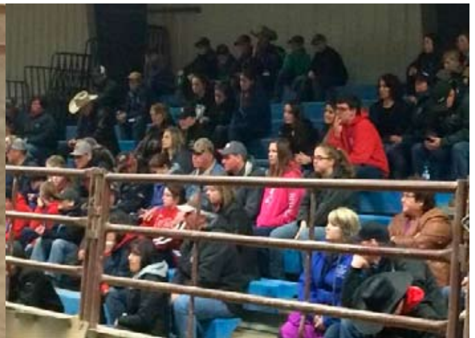
Participants gather for end of day wrap up from Judge Krista Erixon