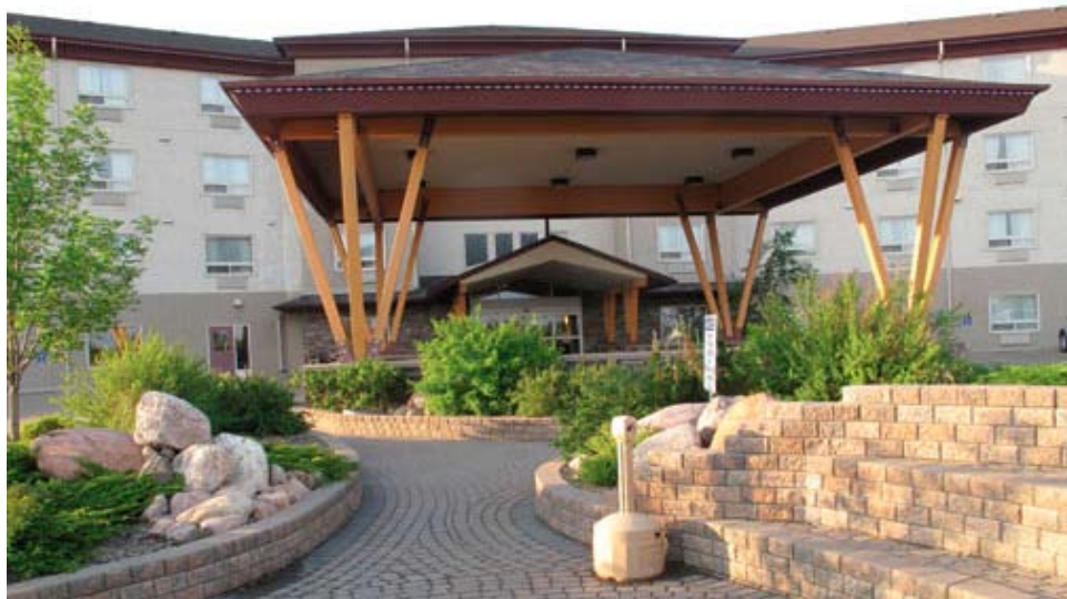
Host Hotel - Gold Eagle Lodge - North Battleford

The SAASE Board of Directors are busy working on the program for this year's convention, but we already know that the Canadian Association of Fairs and Exhibitions (CAFE) will be partnering with SAASE on hosting an Ecoli workshop on Friday February 24th during the day before our registration takes place on the