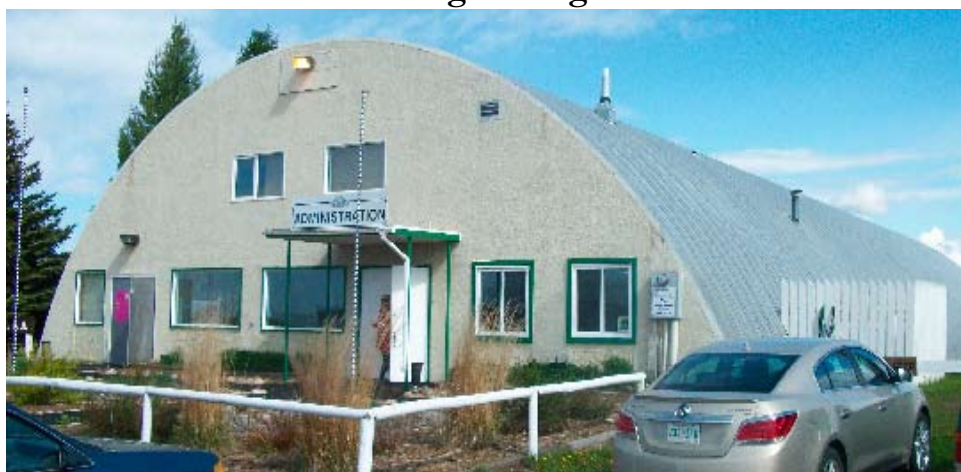
Convention host - Battlefords Agricultural Society