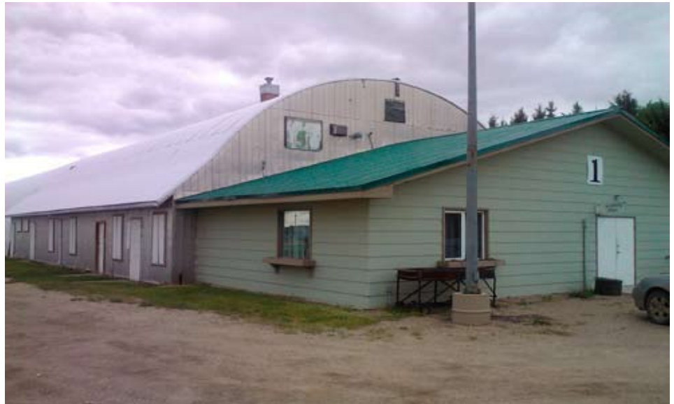
Melfort Agricultural Society Hall and Offices

The Community Initiatives Fund (CIF) today announced approval of 464 grants totaling $4,911,259 in support of Saskatchewan communities. CIF programs contribute to locally led