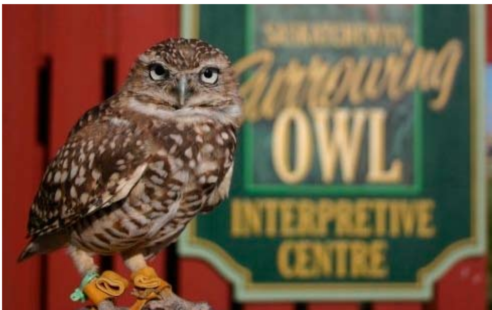
Moose Jaw Exhibition Burrowing Owl Interpretive Centre