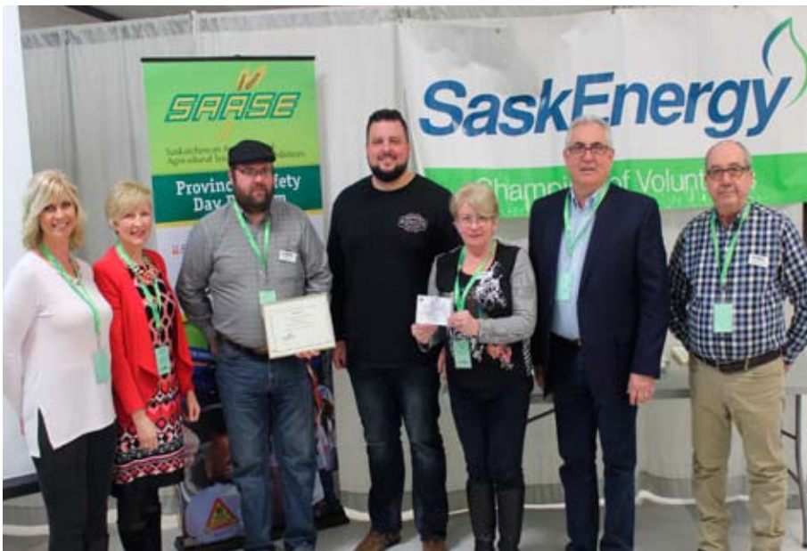
Members of the Prince Albert Exhibition accepts the 135 Year Anniversary Award