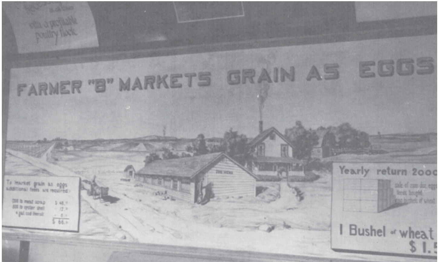
Poultry Display - Railway Lecture Car - 1919