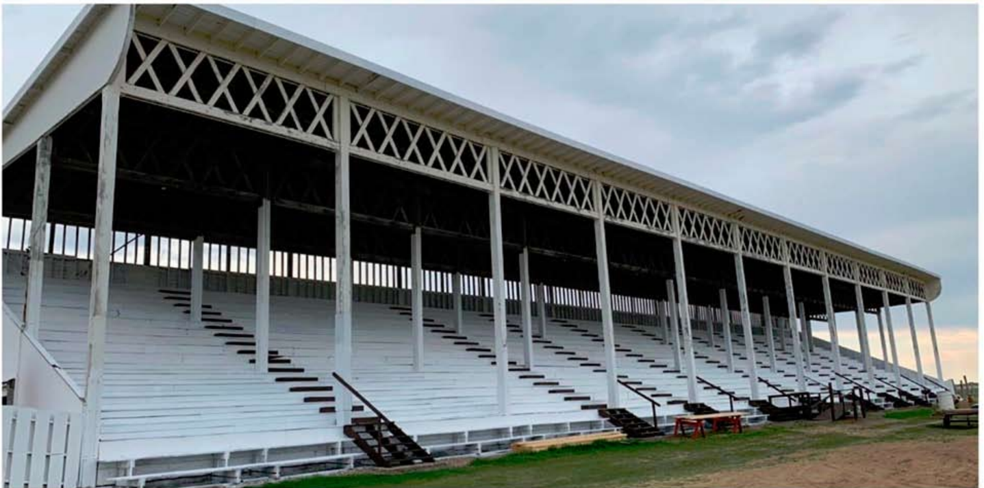
The Melfort Agricultural Society's Grandstand - Before and after volunteers repainted it on June 10th