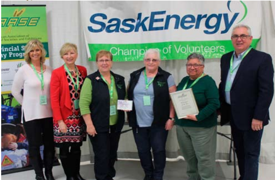
Members of the Vanscoy Ag Society accept the SAASE/SaskEnergy Achievement of the Year Award