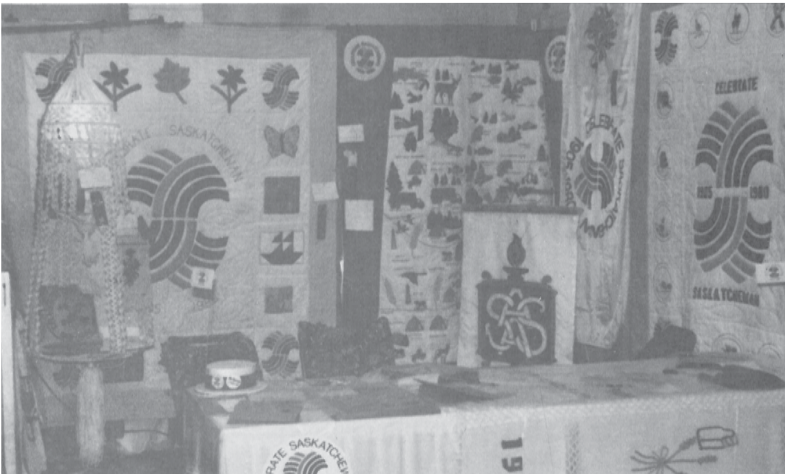
Saskatchewan Agricultural Societies Association display at Mexabition and Agribition in 1980

The CAFE/SAASE convention will be an outstanding opportunity for our members to go and experience the national convention, and SAASE would like to assist as many of our Agricultural Societies as possible to attend. Over the next few months SAASE will be working to put together a registration rate for the CAFE convention for SAASE members, which should make it very attractive to attend.