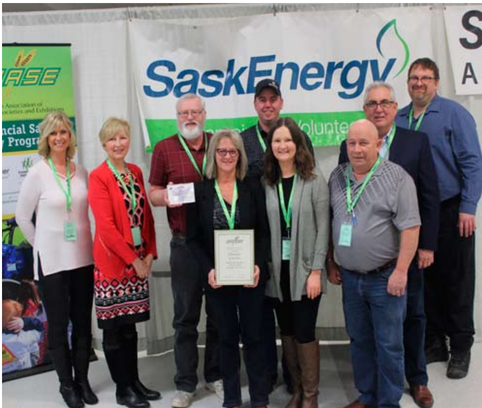
Members of the Swift Current Ag & Ex accept the SAASE/SaskEnergy Achievement of the Year Award