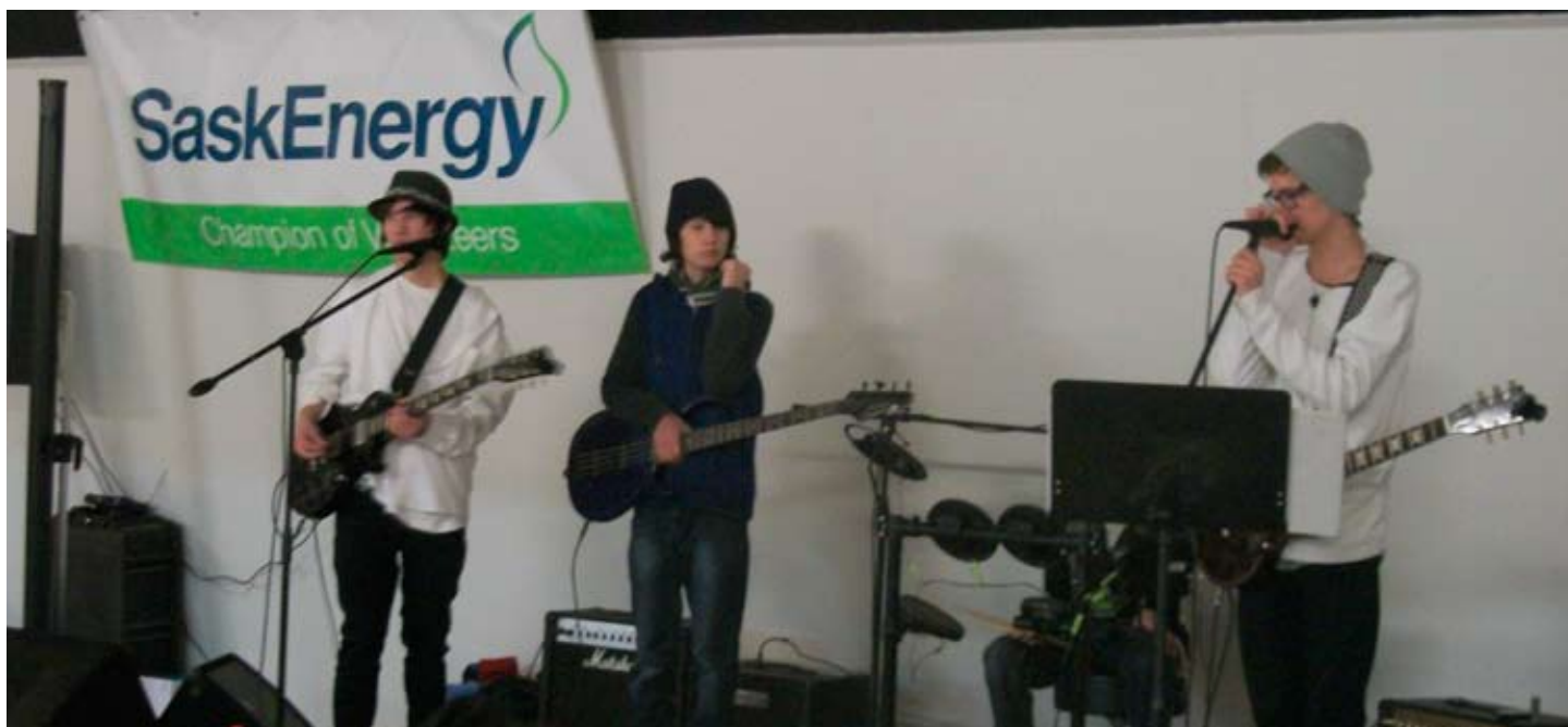
Constant Reminder Entertain at the SAASE 2014 Annual Convention in Melfort