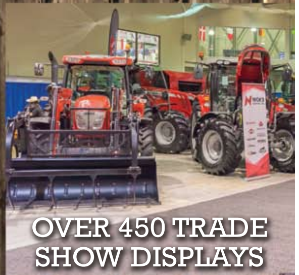
OVER 450 TRADE SHOW DISPLAYS