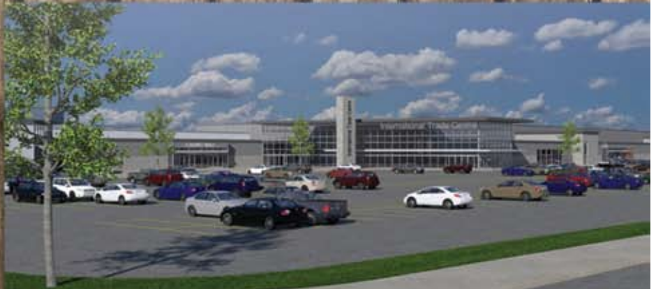
NEWEST, MOST UP TO DATE, LIVESTOCK FACILITY IN CANADA