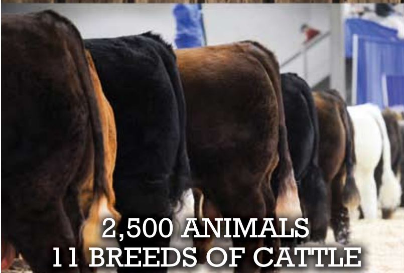
2,500 ANIMALS 11 BREEDS OF CATTLE