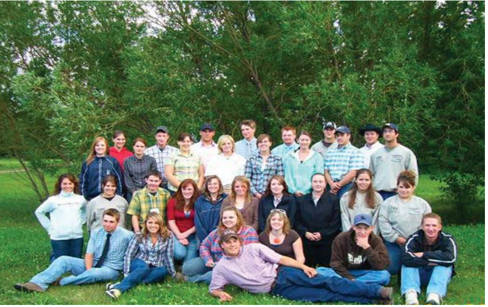
2007 Provincial 4-H Judging Finalists