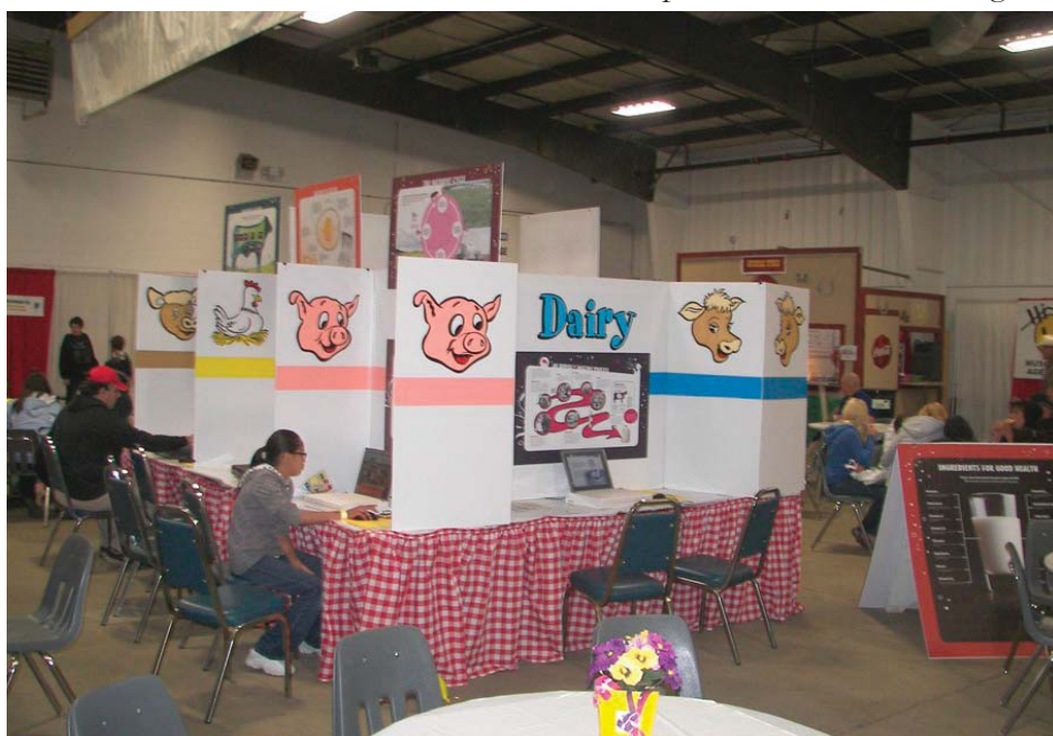
The AG-EXperience at the Lloydminster Exhibition

The program is very exciting and all Ag. Societies are encouraged to book the display for their event. Information on the display is currently up on the SAASE website - www.saase.ca . If there are any questions or you want to book the display for next year contact the SAASE office. It is booked on a first come first served basis, and we have already started accepting bookings for 2010.