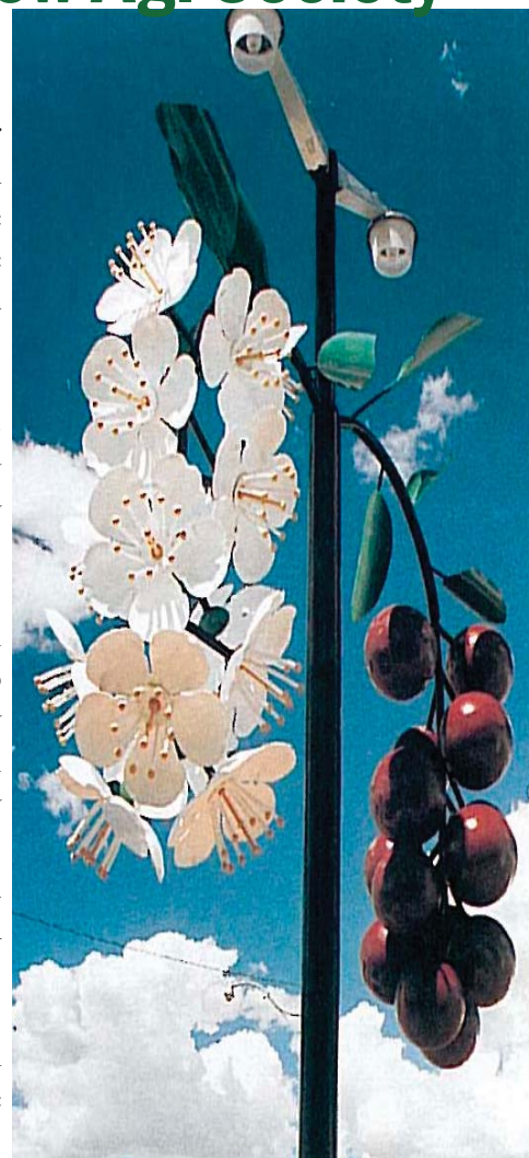
The World's Largest Chokecherry