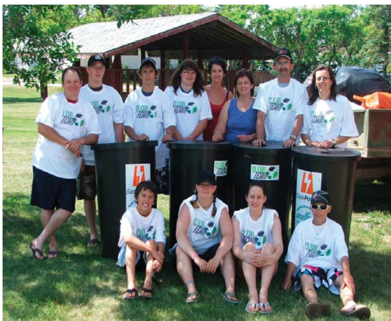
Glenavon Clean Team