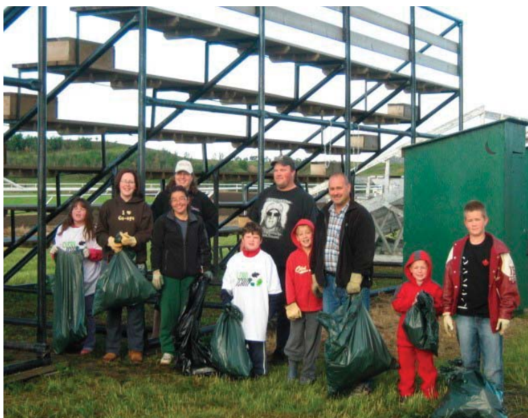
Turtleford Clean Team