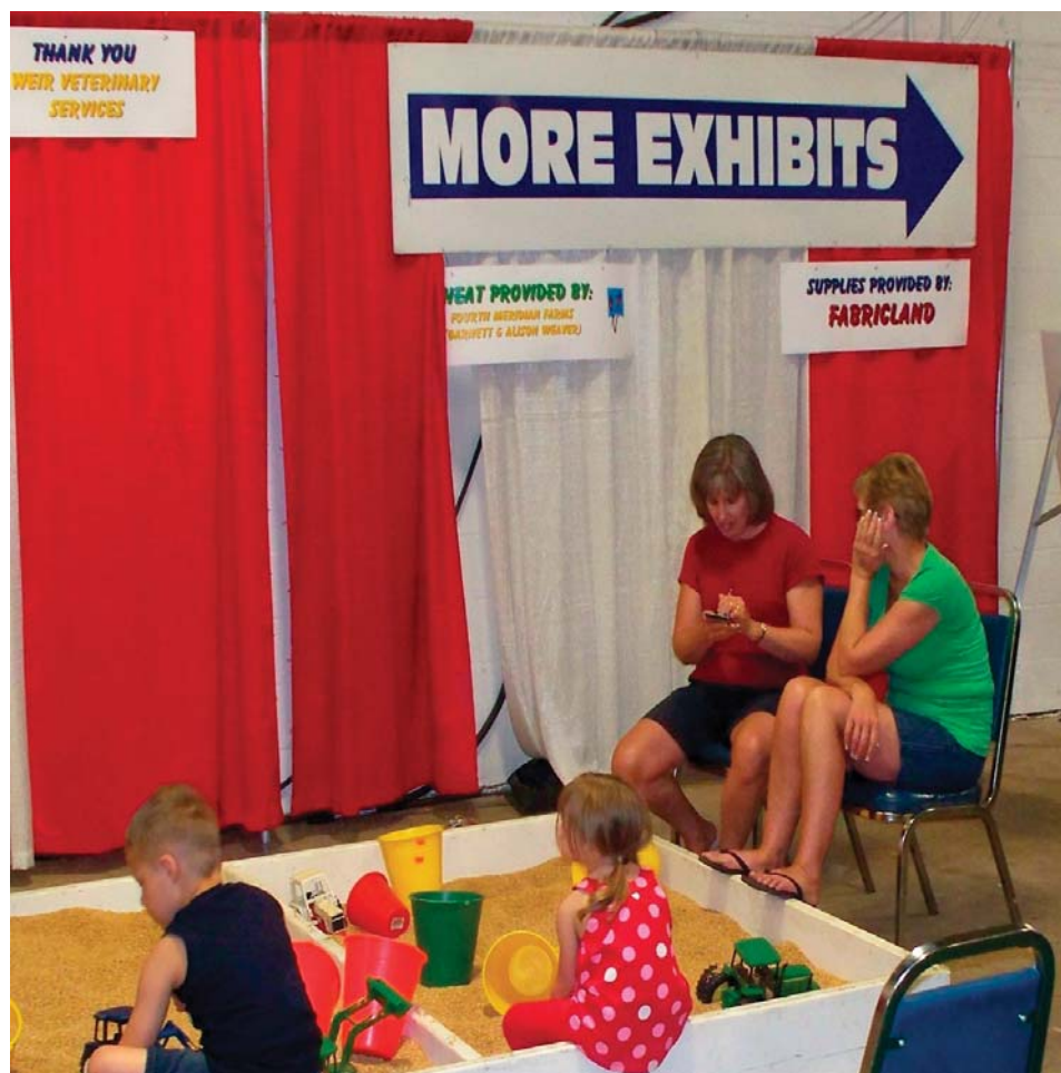
A survey is taken at the Lloydminster Exhibition

Working with the Ministry of Tourism, Parks, Culture and Sport and each particular event the surveys were designed and then loaded onto hand-held survey devices. The surveys