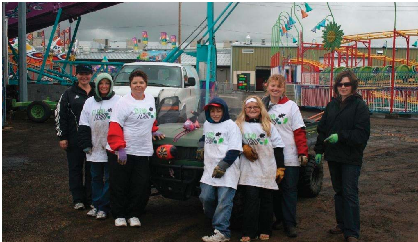
Lloydminster Exhibition Clean Team

If you have any events you would like to add to our list, please contact the SAASE office at 306-565-2121 or email - gduck.saase@sasktel.net .