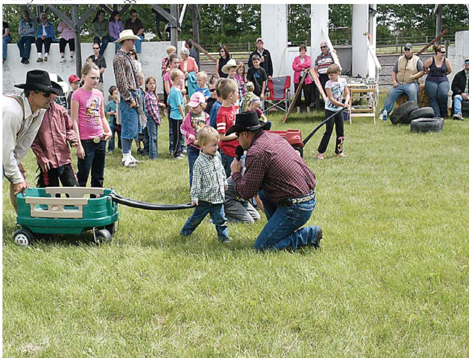
Getting instructions - This little cowpoke gets filled in on what he is supposed to do with his "chuckwagon" during the little buckaroo rodeo held at the Perdue Fair on July 23. This was only one of the events which tested the skills of the juniors. For video on happenings at the Perdue Fair go to biggarindependent.ca