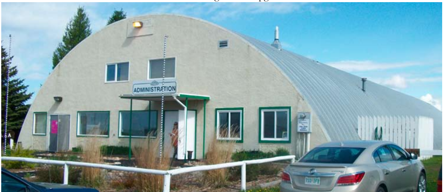
Battleford's Agricultural Society Main Hall and Office