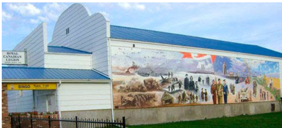
Royal Canadian Legion Hall - location of the SAASE Convention

The SAASE Convention and Annual Meeting will be taking place February 26th - 27th in Nipawin. We are looking forward to a great convention with our hosts - the Nipawin Exhibition - treating us to an excellent weekend. The convention sessions will take place at the Royal Canadian Legion Hall, which is located at 328 1st Ave E. in Nipawin. This is a great location, as our host hotel is the Tobin Lake Motel, which is located right across the street.