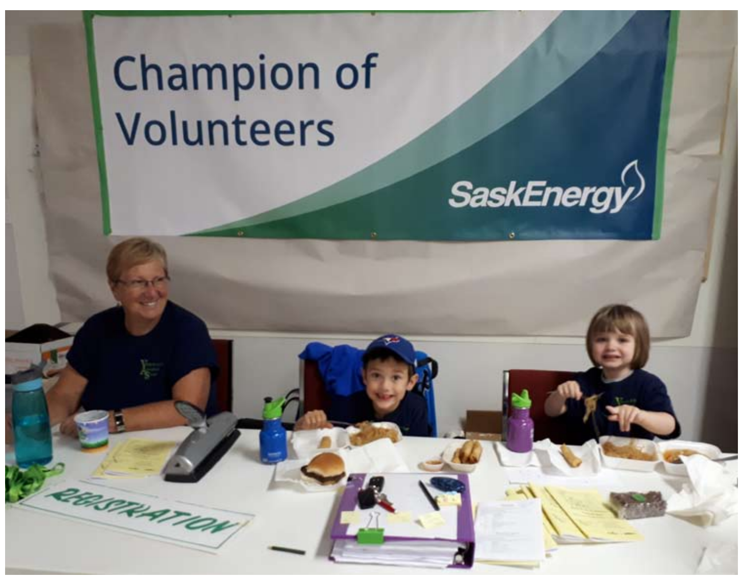
volunteers came back to join us this year at the Fair. We are still eagerly searching for volunteers but are hopefully a few more will join before the end of the year.

Our last goal was to continue to demonstrate that we are a viable and active group in our community that promotes rural living in our community. Our 2019 Fair was our best in years. It was a fun filled event that we worked with the Delisle & District Recreation Board to bring Fall Fest 2019 to our local community. The partnership is the best